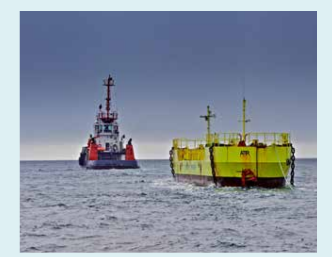
Magallanes Renovables ATIR installation at EMEC