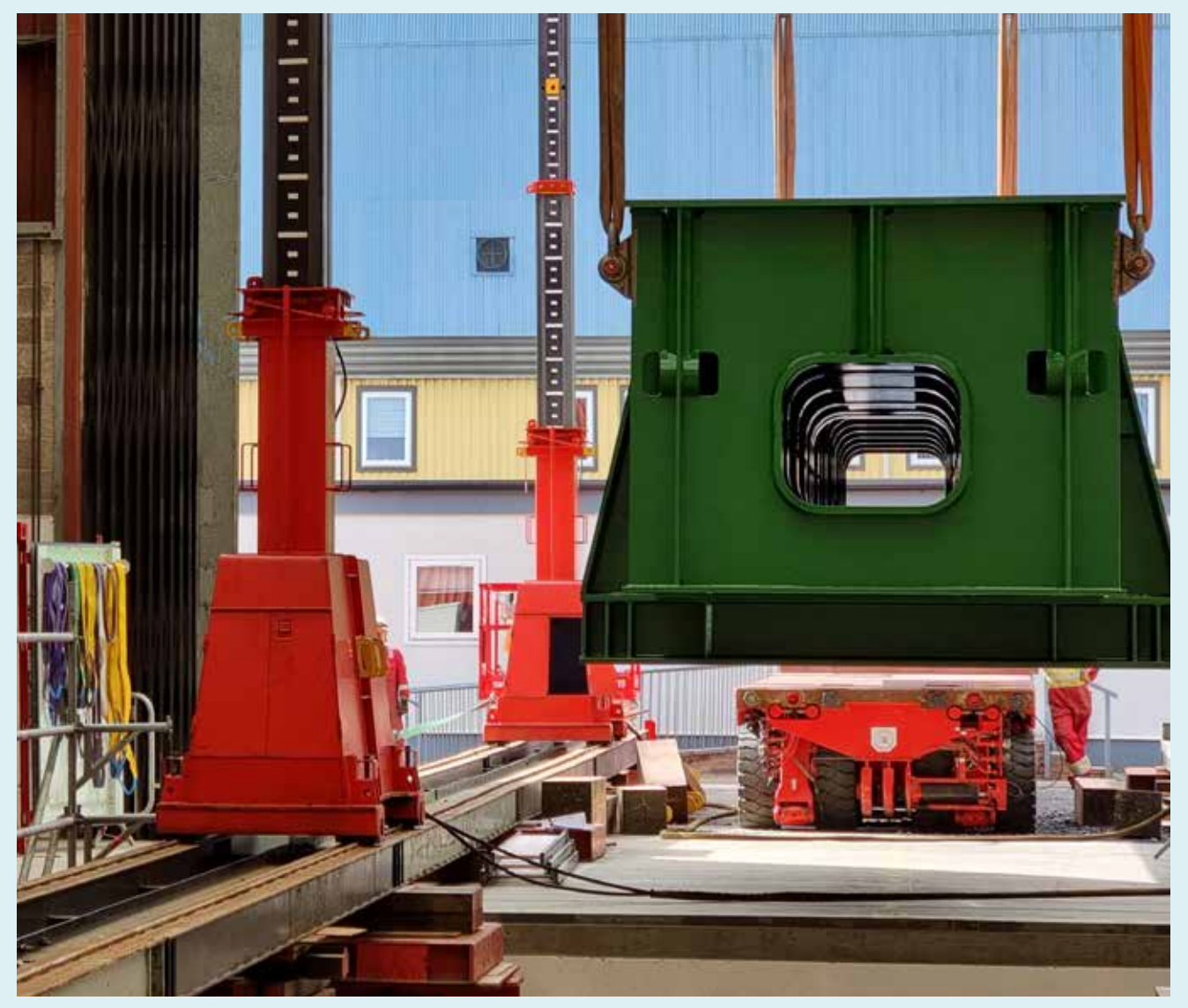
The reaction frame is lifted into position at the FastBlade facility