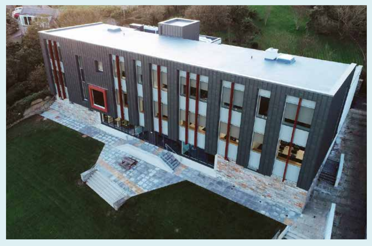
The Orkney Research and Innovation Campus