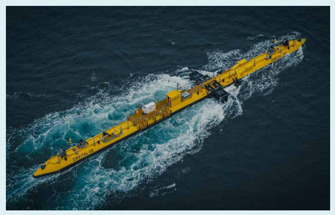
Orbital O2 operating at EMEC test site