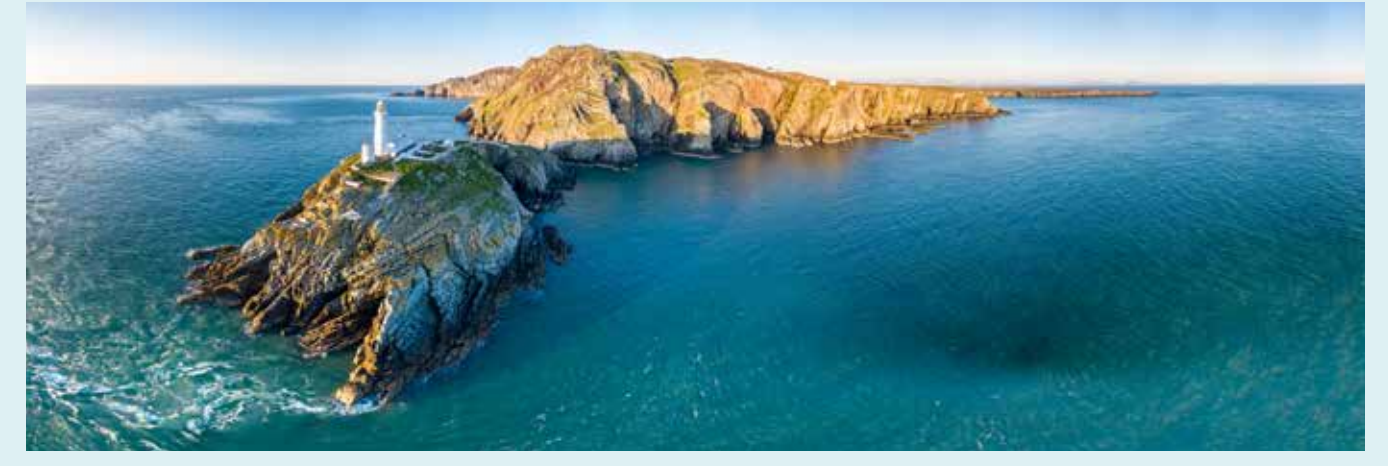
The Morlais Tidal Energy Zone