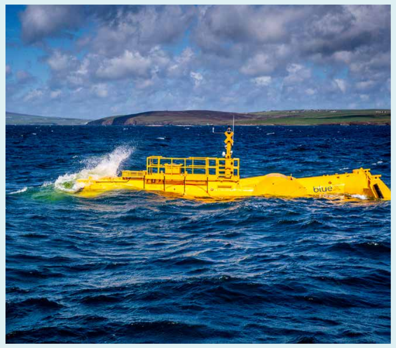
Mocean Blue X at EMEC Scapa Flow test site