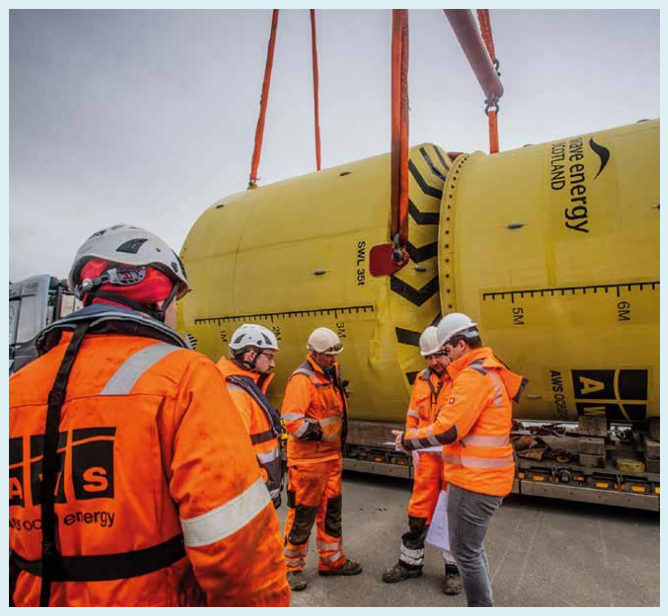
AWS Ocean Energy's Archimedes Waveswing arrives at EMEC