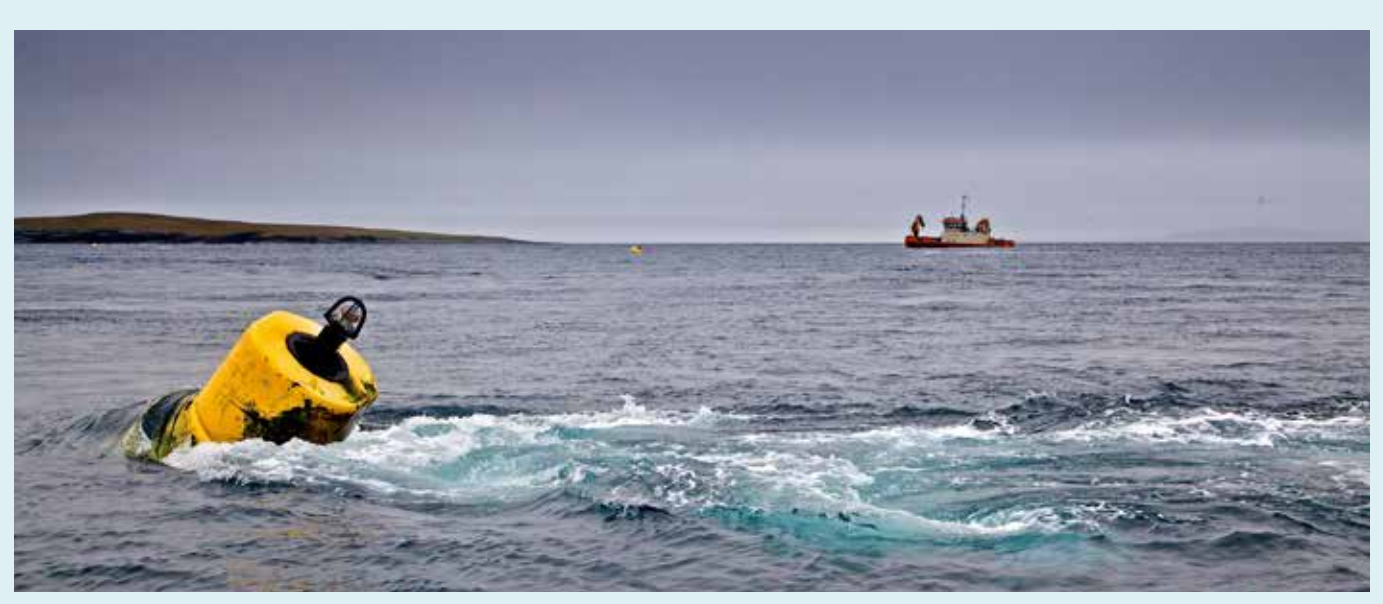
Mooring in Tidal Flow at EMEC Fall of Warness tidal test site