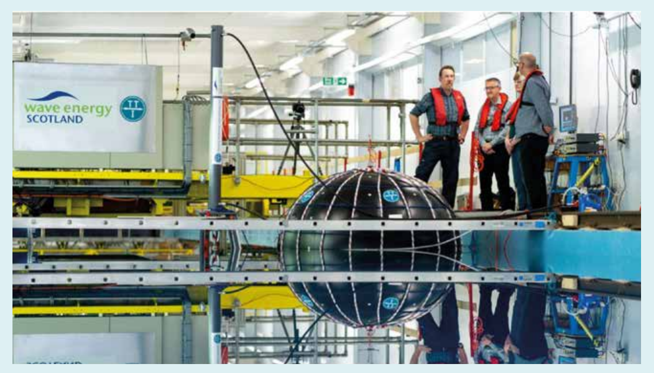
Testing of Tension Technology International's NetBuoy™, funded by WES