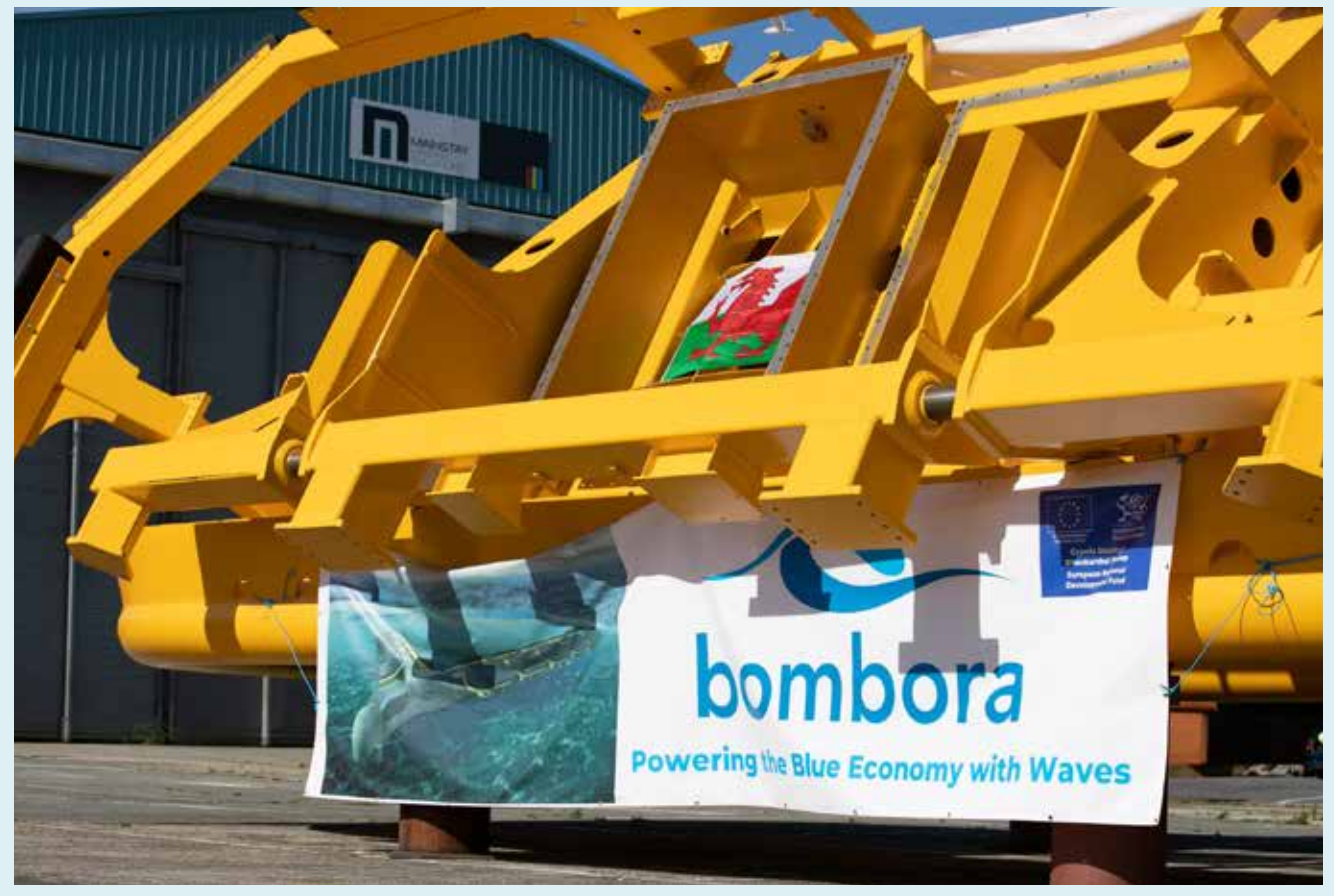
Bombora's full-scale 1.5 MW mWave prototype