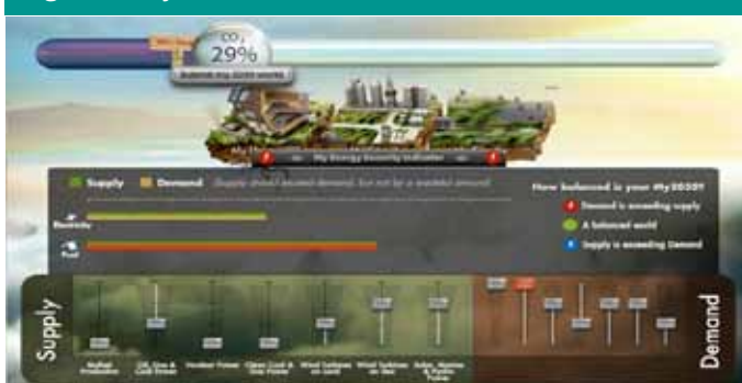
Figure 2. My2050 Scenario Tool

It is possible to ask multiple different questions of data in the analytic process. The questions that have been asked for the analysis reported here are not exhaustive but were derived from academic literature, policy consultation, expert interviews and through input from our advisory panel (see appendix). Additionally, emergent concerns that arose through discussion and appeared as particularly salient for members of the public were treated to analytic scrutiny. It is important to highlight that this form of research and analysis allows for insights into the values and concerns that underlay expressed preferences.